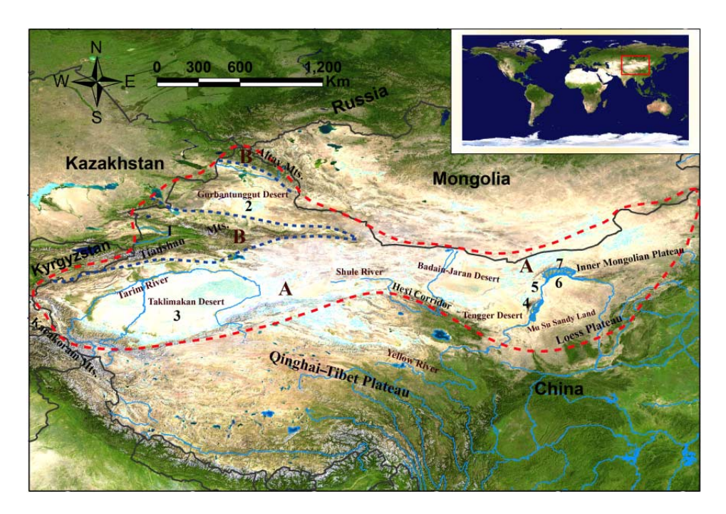
Fig. 1. Major geographical and phytogeographical features of arid Northwest China and significant locations. The red dashed line demarcates boundaries in arid Northwest China; blue dashed lines demarcate boundaries of two floristic subkingdoms according to Wu & Wang (1983). A, Asian desert flora subkingdom; B, Eurasian forest subkingdom. 1, Ili (Yili) Valley; 2, Dzungarian Basin; 3, Tarim Basin; 4, Helan Mountains; 5, Ulanbuhe Desert; 6, Kubuqi Desert; 7, Yinshan Mountains.

The Eurasian forest subkingdom in arid Northwest China, including the Altay and Tianshan Mountains, has undergone glaciation and climatic shifts during the Quaternary (Yi et al., 2004; Lehmkuhl & Owen, 2005; Xu et al., 2010), which belongs to the cold temperate